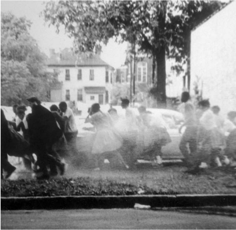
A group of marchers run for safety as they are sprayed with powerful fire hoses.