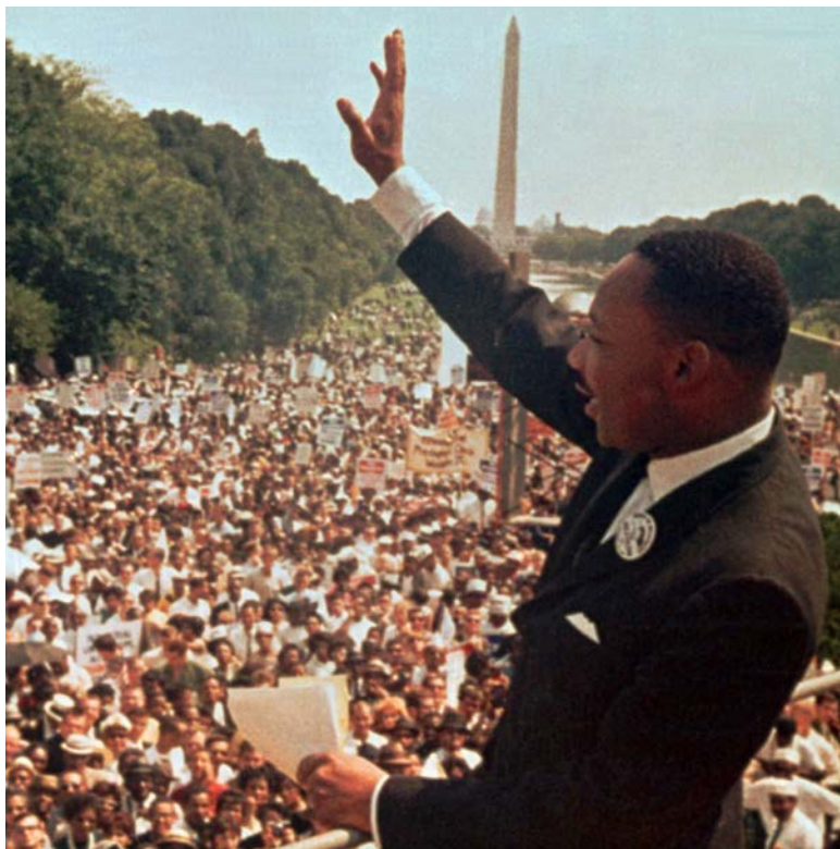
Martin Luther King Jr. at the Lincoln Memorial, 1963