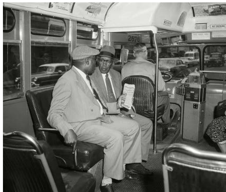
Two black men sit at the front of a city bus in Alabama after the law was changed.

Some whites agreed that the law was unfair. Other whites liked things the way they were. They were angry that Martin wanted to change things. Someone even threw a bomb at his house. But the city finally changed the law to allow blacks to sit wherever they chose on buses.