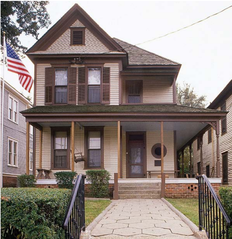
The childhood home of Martin Luther King Jr.

Martin Luther King Jr. was born in 1929. He grew up in a loving family. When he was nineteen, he decided to become a minister . His first job was at a church in the state of Alabama.