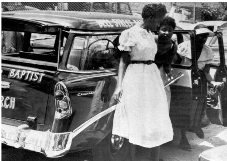
Blacks walked or shared cars instead of riding city buses. These women shared a station wagon to get around town.