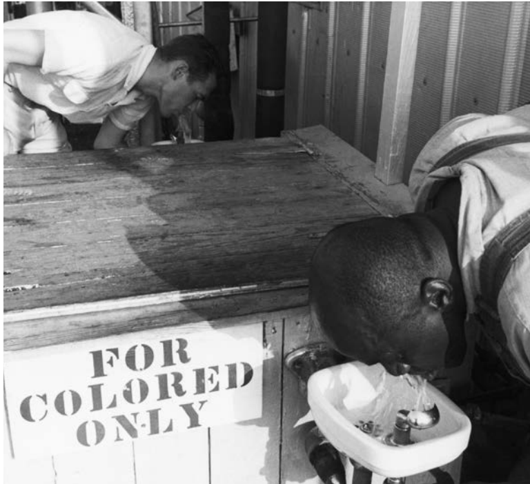
A black man drinks from a fountain labeled "For Colored Only." In 1960, around the time this photo was taken, colored was the word often used for African Americans.

These unfair laws took away the rights of many blacks. Black children had to go to different, poorer schools than white children. Blacks had to use different drinking fountains and bathrooms. On buses, blacks had to sit in the back and give up their seats if whites wanted them.