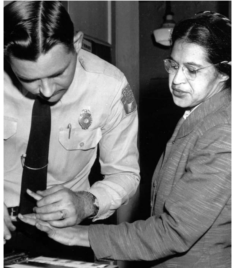
Rosa Parks refused to give up her bus seat. After her arrest, a police officer took her fingerprints.

In 1955, a black woman refused to give up her bus seat to a white man. She was put in jail for breaking the law. When Martin heard what happened, he decided to act.