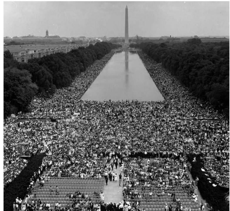
Martin’s 1963 March on Washington ended near the Lincoln Memorial. At that time, it was the largest march ever held in the capital.

Around the country, people saw how African Americans were treated. More and more people wanted to change the laws to be fair to everyone. When Martin led a march in Washington, D.C., more than 250,000 black and white Americans marched with him.