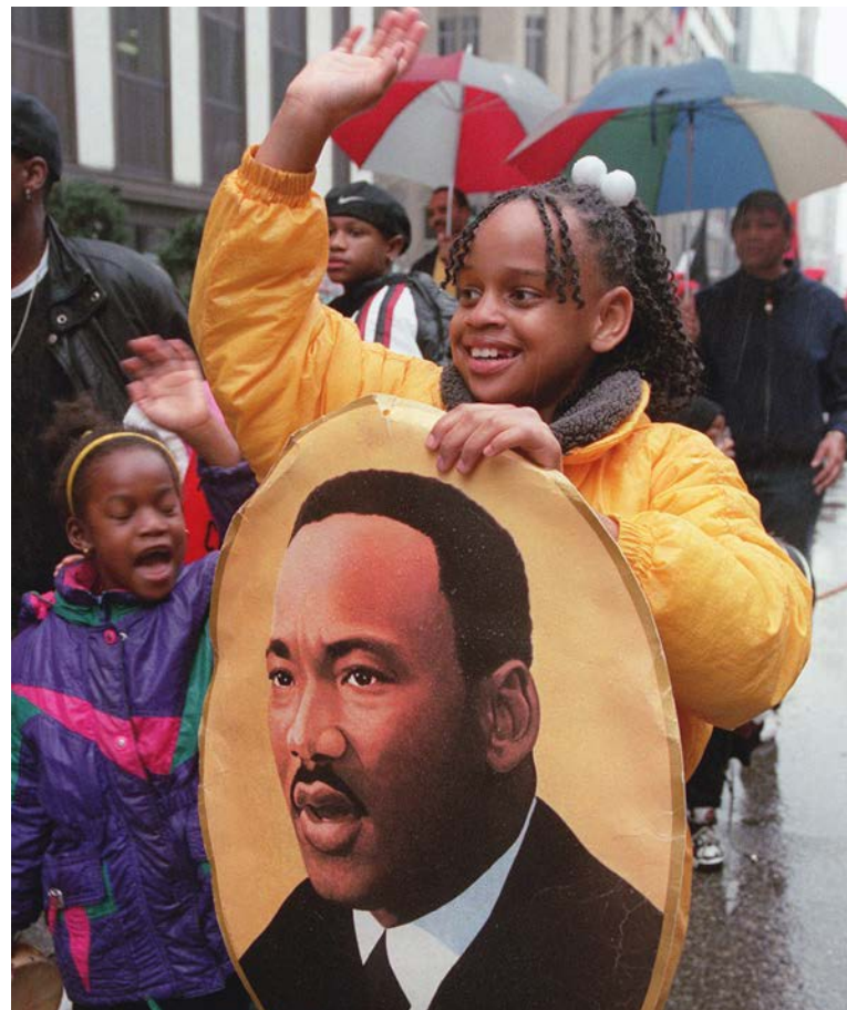
A girl marches in a Martin Luther King Day parade.