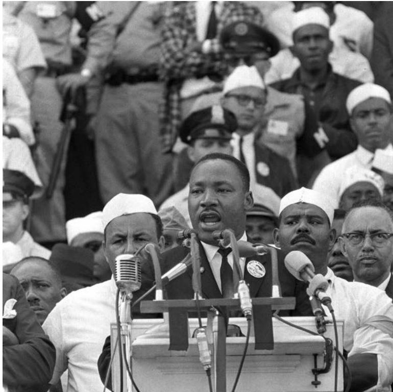
Martin Luther King Jr. gives his famous "I Have a Dream" speech.

At the march, Martin spoke to a cheering crowd. He shared his dream that one day, the color of a person's skin wouldn't matter. All people would be "free at last." The next year, the United States passed a law ending the separation of blacks and whites.